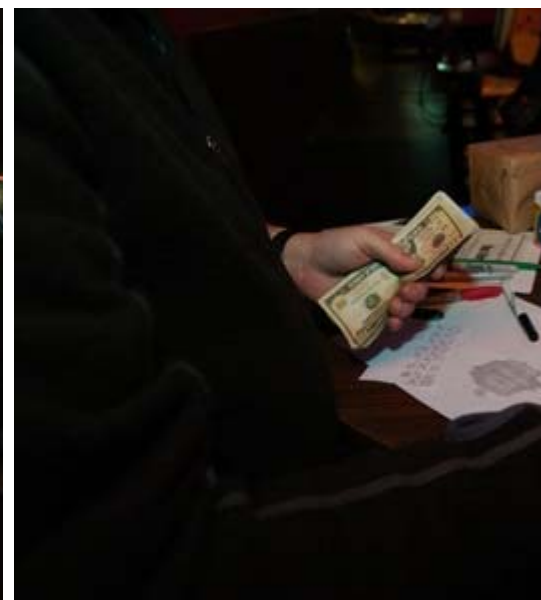
"Fun"-Raising Night with Arbor Band Das Vorge brought in over $1300!